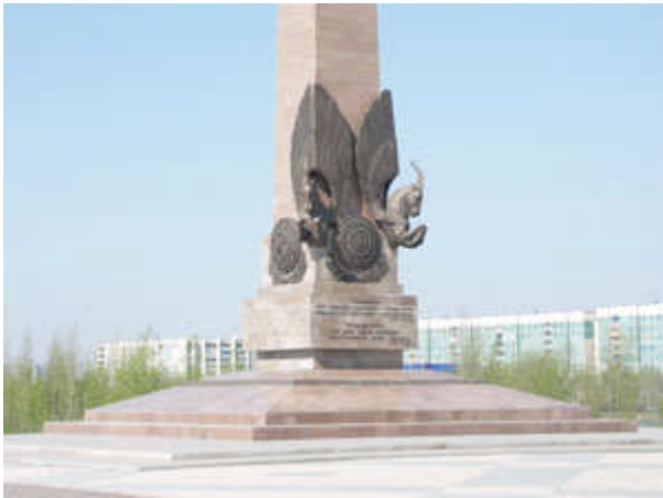
Memorial of Independence of Kazakhstan from the Soviet Union